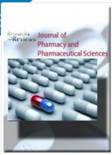
Journal of Pharmacy and Pharmaceutical Sciences

Oral abstract deadline Extended Untill April 11 th 2018